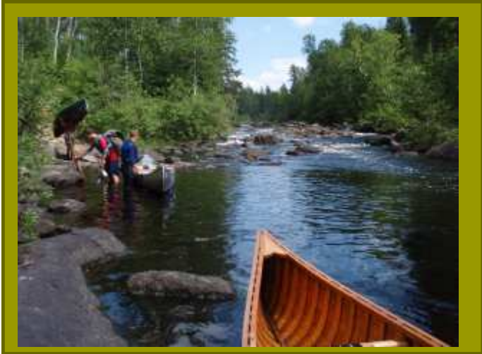
Aaaahh, the end of the portage