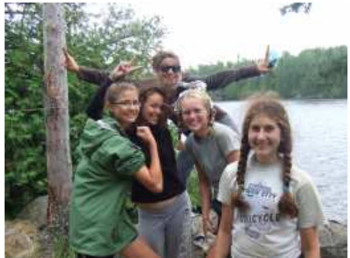
An awesome group has an awesome time in an awesome place in the BWCA