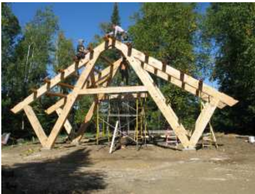
The Welcome Center timber frame structure is assembled on the parking lot or Massie’s Landing, side of the lake.

The Welcome Center rose from the dirt last week as Steve Anderson, Menogyn’s beloved caretaker (Site Manager for you modern types), members of Crown Construction and Tom Healy assembled pieces cut and shaped by volunteers in April. Huge white pine sections, some 10” x 14”, were meticulously cut at the North House Folk School in Grand Marais. This is our fourth structure at camp which uses the timber frame construction method, which shows that we have been very happy with it. The structures are solid, easily adaptable to the need, make better use of wood than log structures and can be insulated especially well. For extra credit, they can be disassembled and rebuilt in a different location if you need to, though I wouldn’t want to do that!