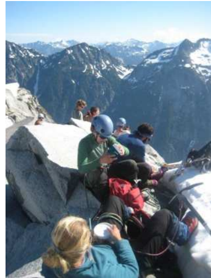
The Nisimaha group has a break high in the alpine country of the North Cascades, Washington

"The experiences I had on trail, in camp and with Menogyn campers and staff have shaped me for the better."