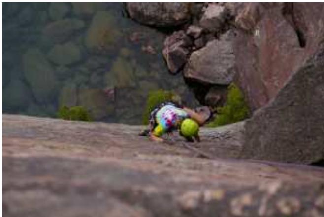
Climbing on the beautiful shores of Lake Superior and Tettegouche State Park